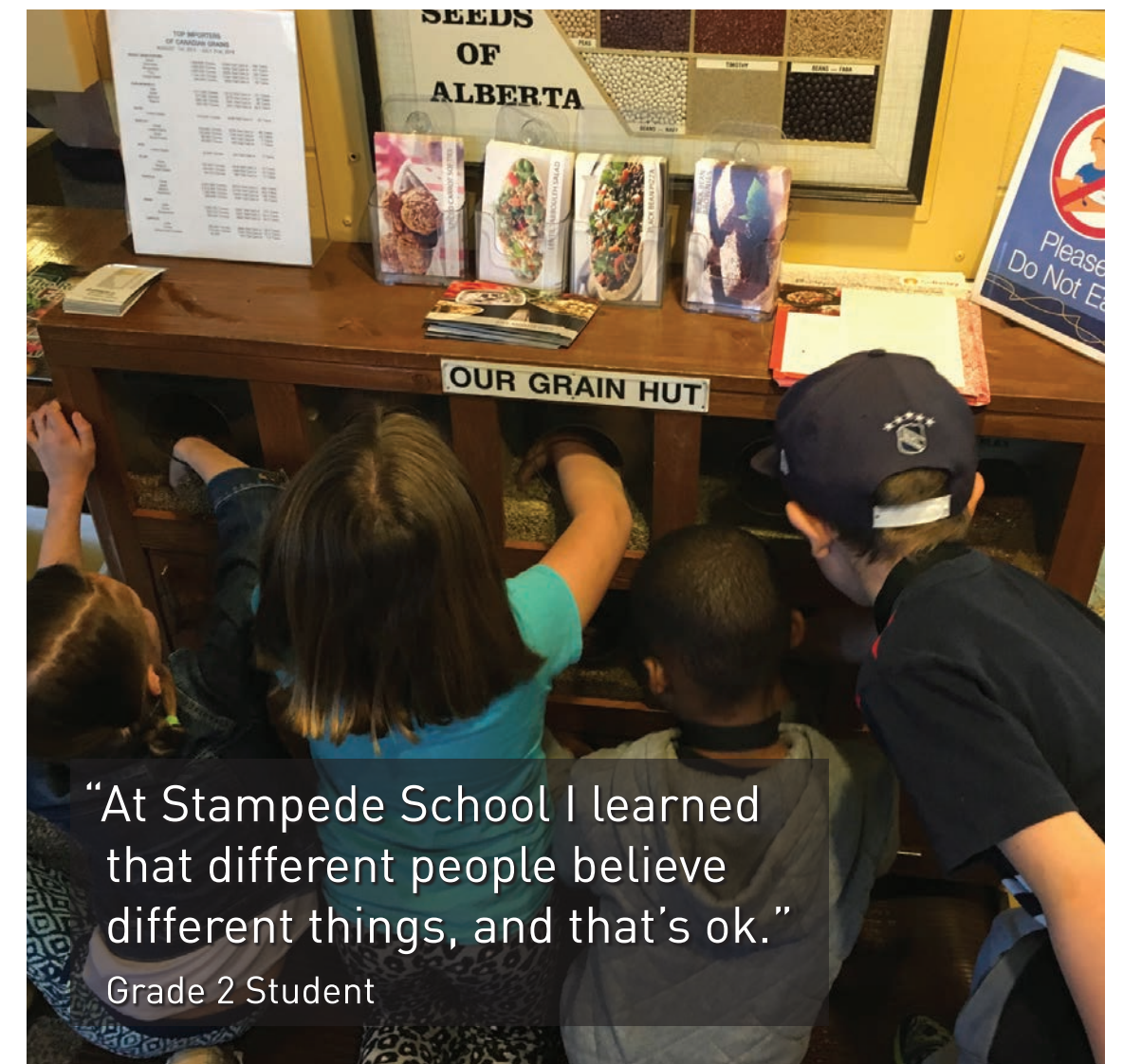
"At Stampede School I learned that different people believe different things, and that's ok." Grade 2 Student