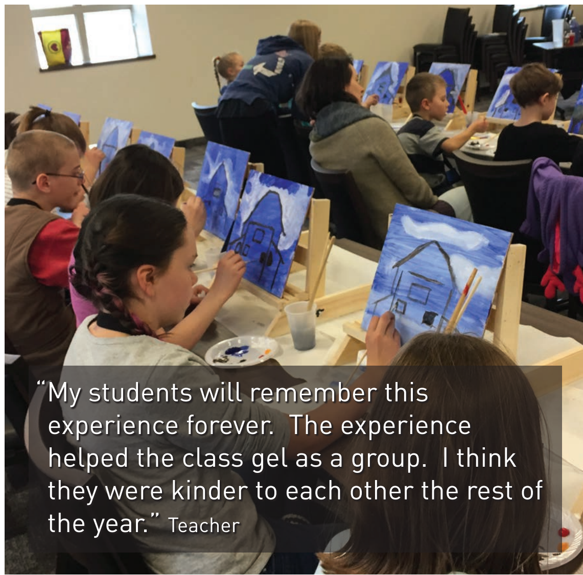
"My students will remember this experience forever. The experience helped the class gel as a group. I think they were kinder to each other the rest of the year." Teacher